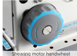
Stepping motor, operate lightly

Suitable for clothing items such as shirts, suits, pants, down jackets, etc.